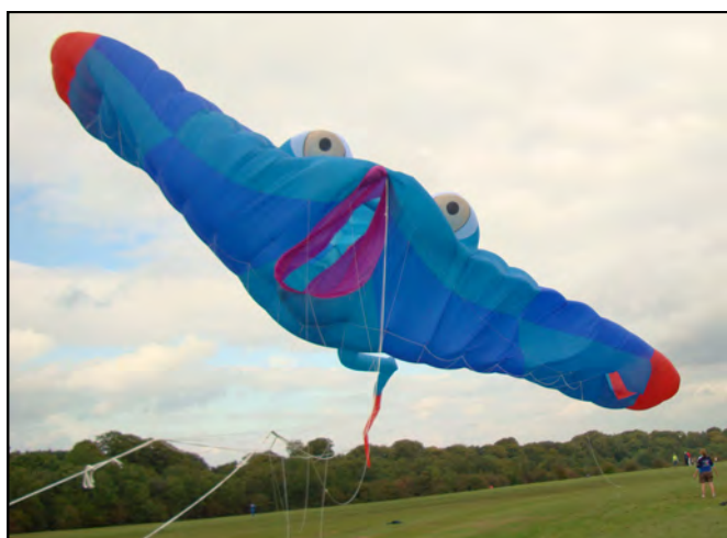
Why do I think "Blue Meanie"