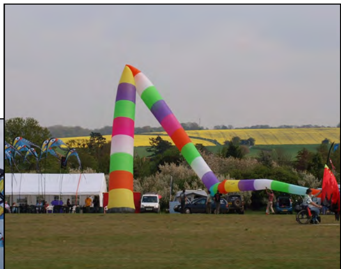
It's amazing the colours you can get for condoms these days!