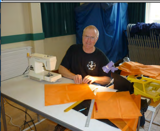
"What's wrong with Orange!!"