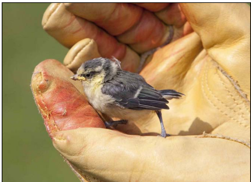
"I was doing quite well on my own thank you"

Luckily help was on hand to save the day and move them nearer the bushes