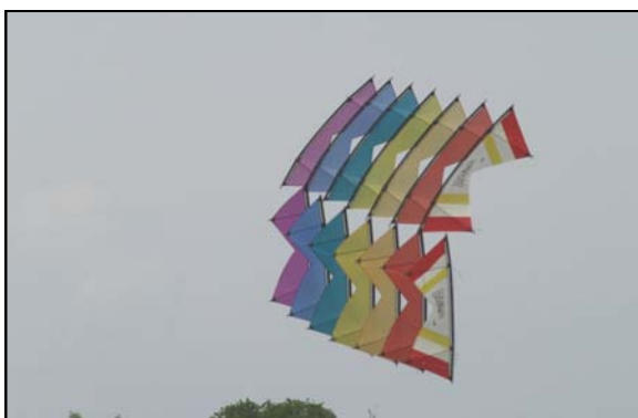
Rev stacked x 2