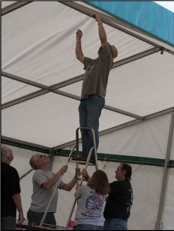
Where's Health & Safety??